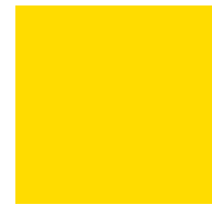
Goldenrod HEX FFDC00

Fonts Pick no more than 2, use bold and italics to add more interest and differentiate sections